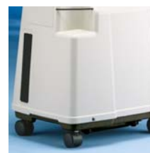
Only four cabinet fasteners.